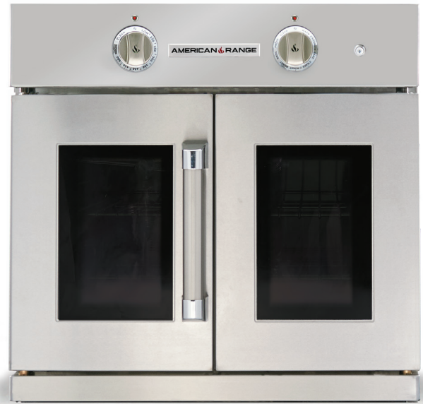
SEF-30 SHOWN IN STAINLESS STEEL, AVAILABLE IN ANY RAL COLOR